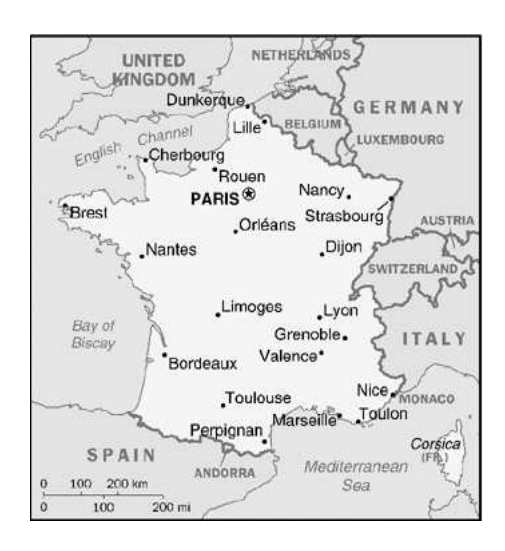
Figure 1: Map of France